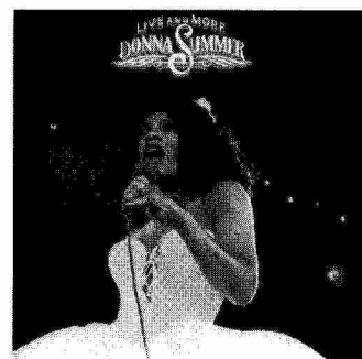
3. Donna Summer 334